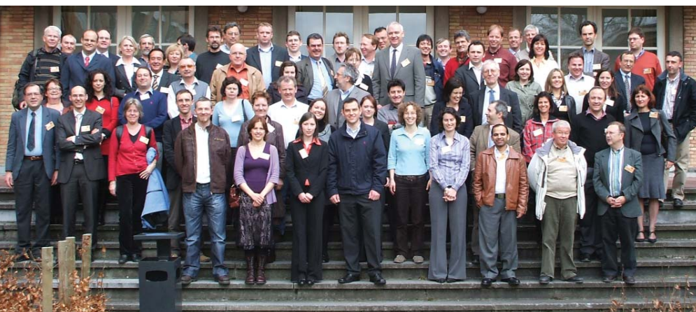
Below: The ProSafeBeef team

Pillars and to perform training and dissemination to end users. Throughout the life of the project, demonstration activities will be organised to prove the technological and economic viability of selected new technologies at industrial or pilot scale. A “core team” of eight scientists and technological trainers has been set up to promote the transfer of knowledge and technologies to meat companies and particularly SMEs. This core team will continue to identify new technologies appropriate for demonstration from the project, and will be closely involved with future demonstration activities.