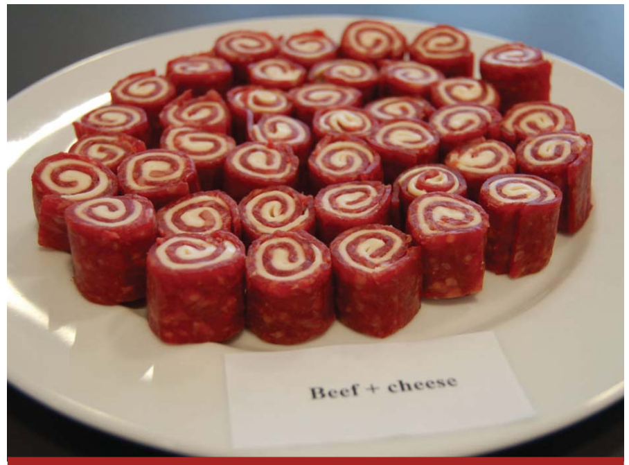
An example of OSMOFOOD® products